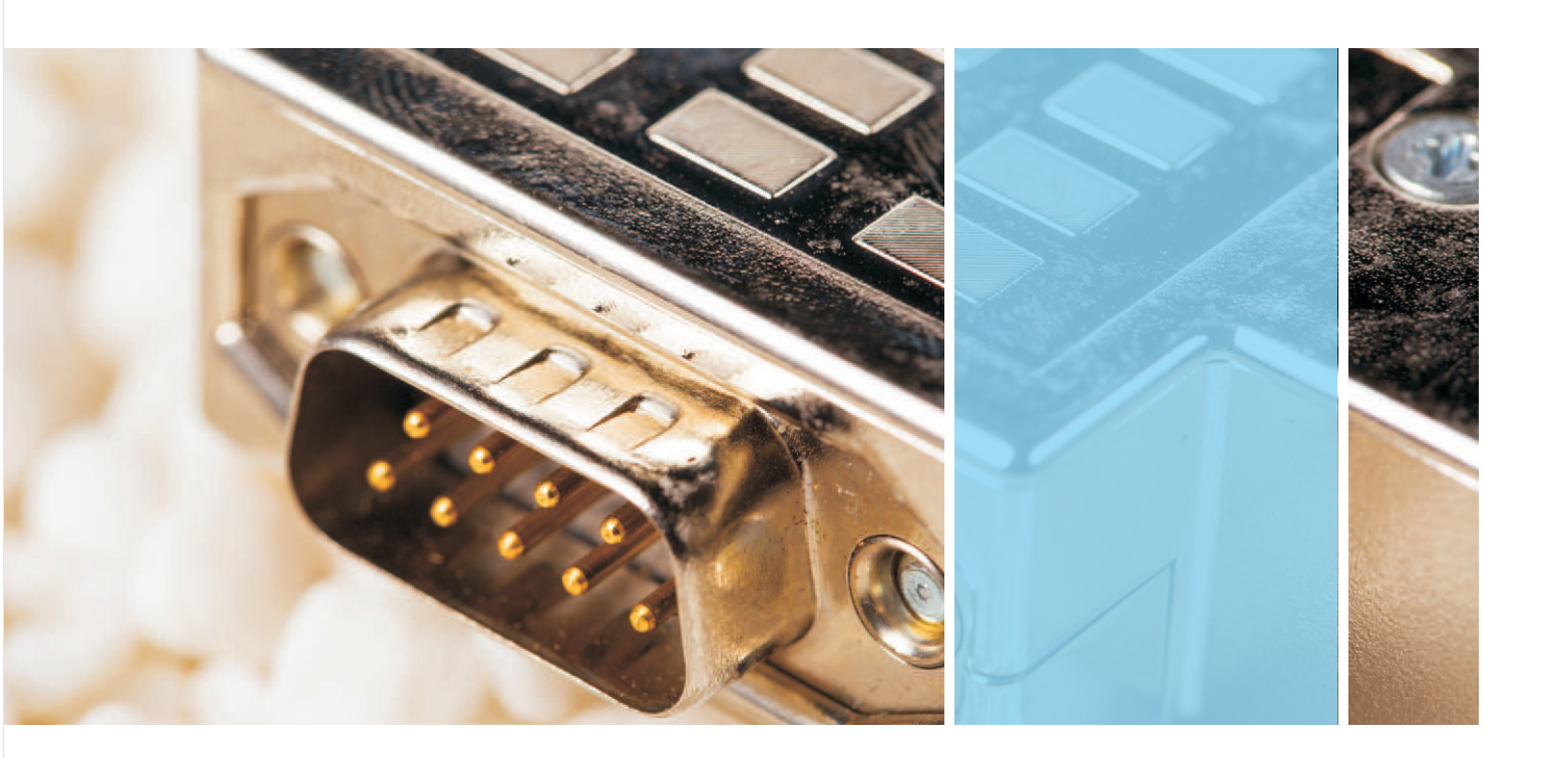
SOFTLINK · Field-bus Connector